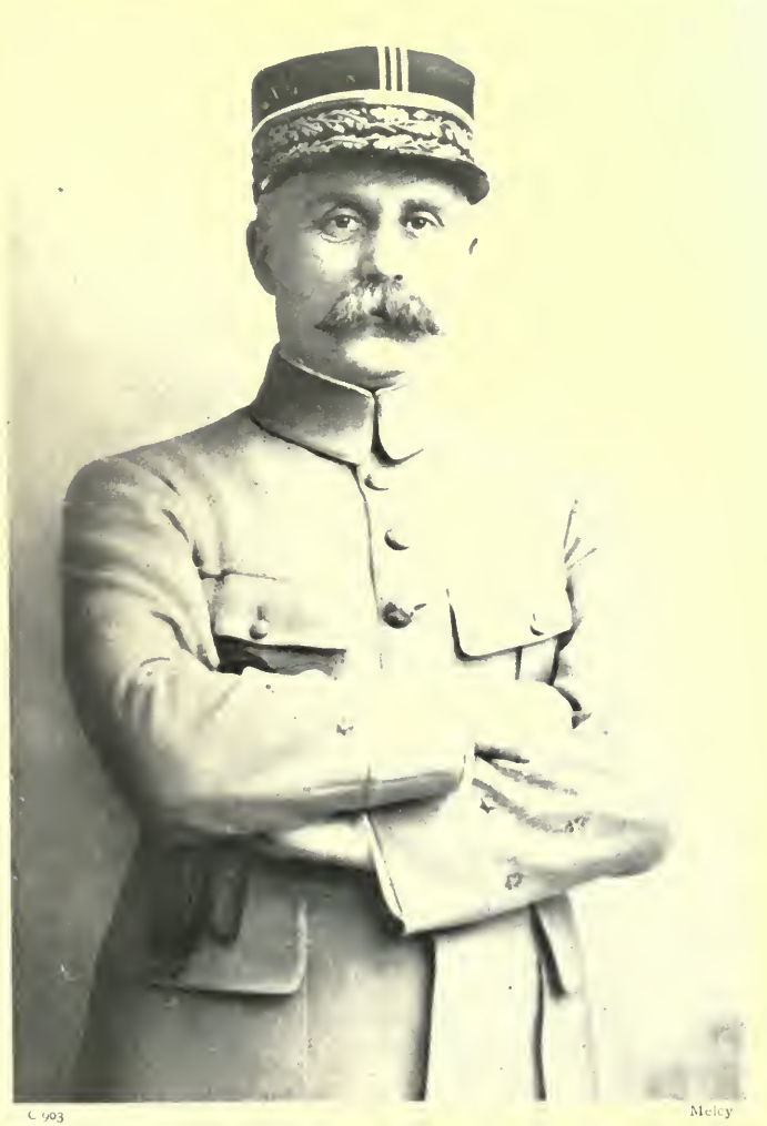
GENERAL PÉTAIN Commander-in-Chief of the French Armies in France.